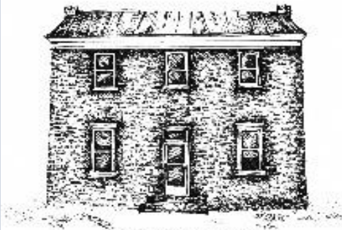
BLAND COUNTY JAIL ESTABLISHED 1866

Mailing Address: PO Box 416 Bland, VA 24315 Email: info@blandcountyhists.org