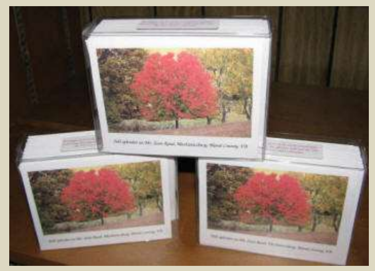
FEATURED ITEM - 2013 NOTE CARDS

NEW. Gift boxes of 13 note cards/envelopes, featuring the color photos of beautiful Bland County in the 2013 Bland County Historical Society Calendar. Boxes are sturdy clear plastic, suitable for gift-giving, and sell for Contact the Society office for more information, 276-688-0088. $18.00/box at the shop, or may be shipped for $23.00. The notecards may also be purchased individually for $2.00 each.